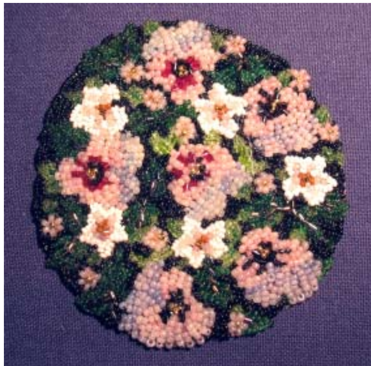
Anne Walden-Mills' beaded pansies used bead sizes 20-23, silk thread and size 16 beading needles.