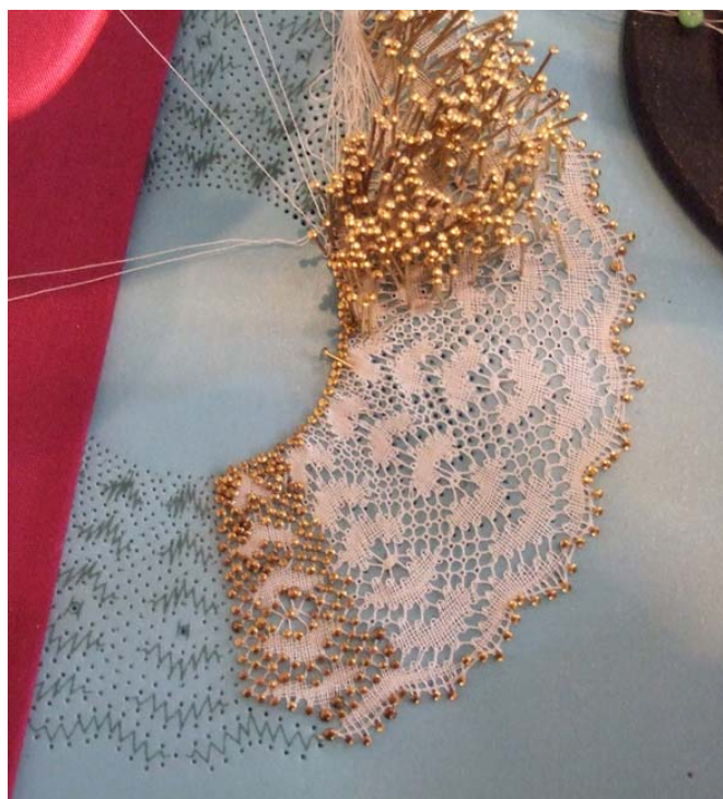
Our experienced lace maker's work (a parasol)